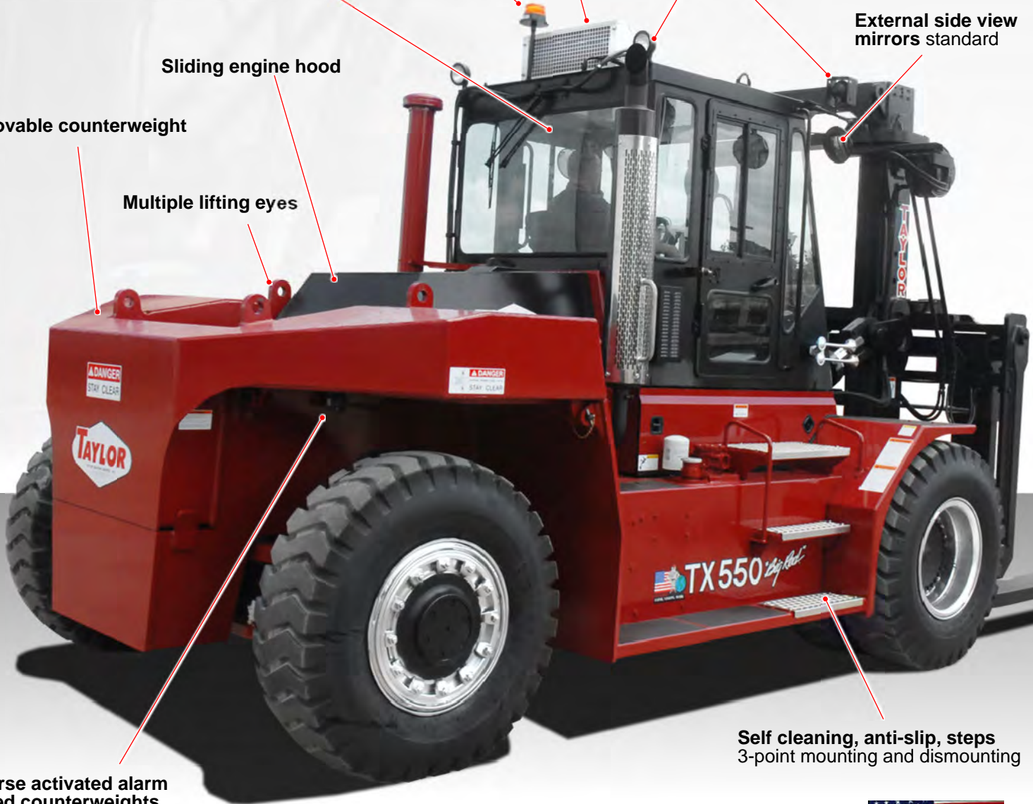
Self cleaning, anti-slip, steps 3-point mounting and dismounting