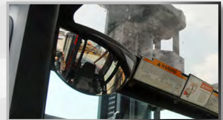
Dual panoramic interior rear view mirrors standard Dual external side view mirrors standard Optional pedestrian camera and monitor

This blend of ergonomics and technology will help your operator be more efficient with the job at hand... handling materials.