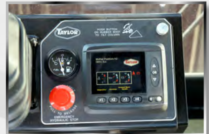
Easy to understand diagnostic display. TICS (Taylor Integrated Control System) using CANbus technology is standard on the TX-550RC

The TX-550RC features a spacious, all steel cab with increased leg and head room, sound deadening rubber mat flooring, tilt steering wheel, simple T-shaped dash with hinge down instrument panel, fingertip electric joystick controls, and optional climate control system for operator comfort and convenience.