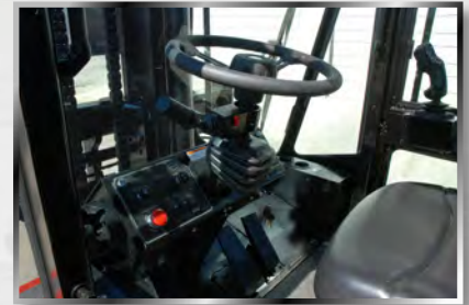
Spacious uncluttered cab with tilt steering, hinge-down dash, climate controls and adjustable seating Premium vinyl or cloth seat that rotates 15° left and 20° right