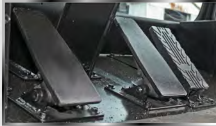
Two brake pedals left – brakes and inching right – brakes only