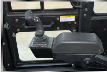
Comfortable adjustable arm rest with fingertip joystick control for smooth precise handling