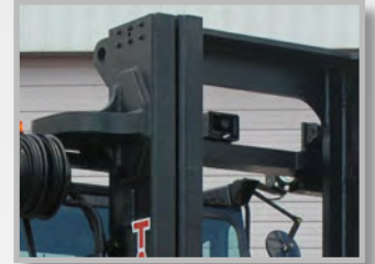
Forward activated alarm

Unobstructed rear view The air snorkel and shielded exhaust are mounted on the corners of the cab to keep the view open.