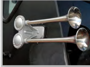
Highly audible air horns