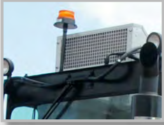
Key-switch actuated amber strobe light