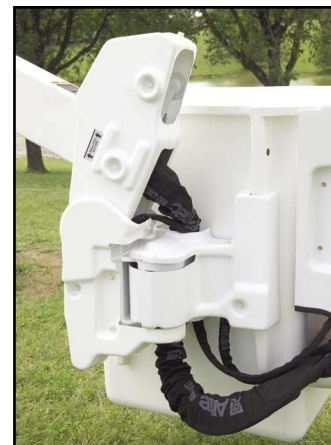
Boom Tip Covers

sales@altec.com Sales – 800-958-2555 Service – 877-GOALTEC