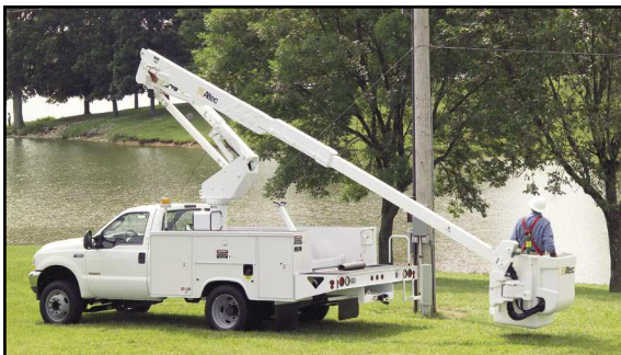
Easy Access From Ground

Altec Aerial Devices meet or exceed all applicable ANSI Standards as of the date of manufacture. Altec reserves the right to improve models and change specifications without notice or obligation.