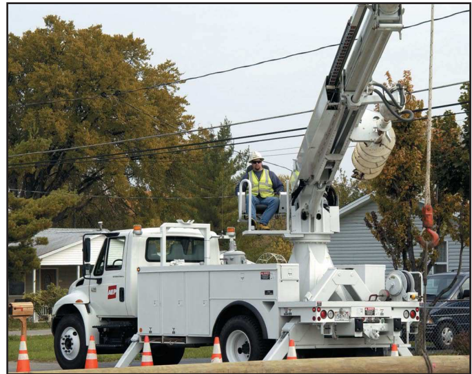
Altec Opti-View® Control Seat increases operator comfort and provides a full view of the work area.