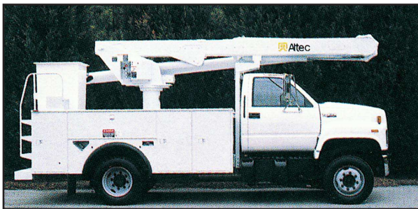
Side-by-Side Booms for Low Travel Height

*Based on 40 in (1016 mm) Chassis Frame Height