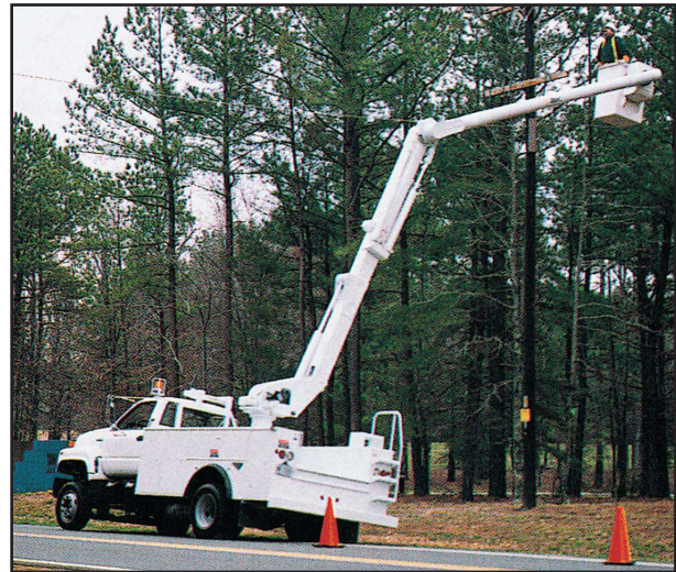
Superior Working Reach with No Outriggers

Altec Aerial Devices meet or exceed all applicable ANSI Standards as of the date of manufacture. Altec reserves the right to improve models and change specifications without notice or obligation.