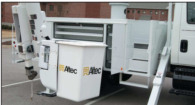
125 degrees of lower boom articulation allows operator to access bins and the ground from the non-overcenter position.

*Based on 40 in (1016 mm) Chassis Frame Height