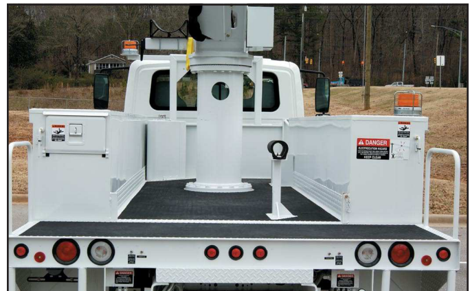
Select the normal upper boom stow position for open bed space or the low stow position to simplify platform access.

Altec Aerial Devices meet or exceed all applicable ANSI Standards as of the date of manufacture. Altec reserves the right to improve models and change specifications without notice or obligation.