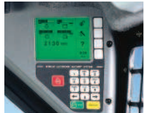
Optional Deluxe Instrument Panel

State-of-the-art instrument panels provide dozens of operational features, diagnostics and monitoring. Optional deluxe instrument panel includes keyless start security system, feature lockouts, digital time and job clocks, multi-language display, even a "help" menu.