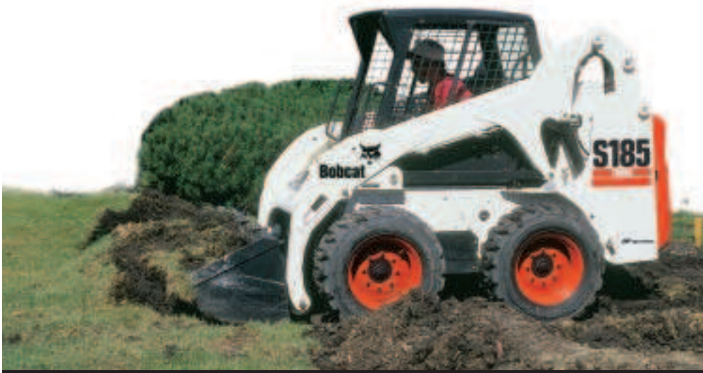
Bobcat engineering sets the standard for comfort, visibility and performance!