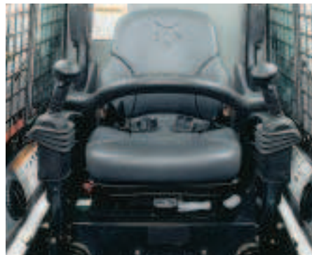
More Operator Comfort

State-of-the-art instrument panels provide dozens of operational features, diagnostics and monitoring. Optional deluxe instrument panel includes keyless start security system, feature lockouts, digital time and job clocks, multi-language display, even a "help" menu.