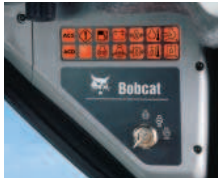
Right Side Standard Instrument Panel