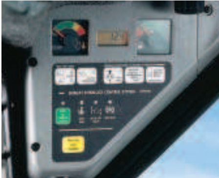
Left Side Instrument Panel

Bobcat S175 and S185 loaders deliver a wide range of innovative, operator-friendly features and exciting value-added options.