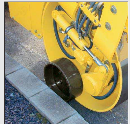
Option: edge compactor; compacts close up to curb edge.