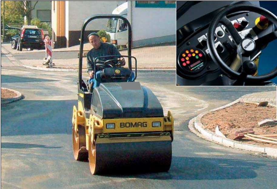
BW 120 AD-4: vibration insulated operator's platform; good visibility across sloped engine hood and angled support legs.

The combination rollers BW 100 AC-4, BW 120 AC-4 and BW 125 AC-4 are specialist asphalt models. They combine the high compaction output from the drum with the excellent surface sealing from the 4 rear rubber wheels.