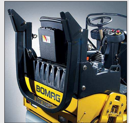
Option: folding ROPS