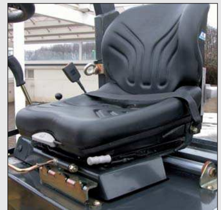
Option: lateral shifting seat; twin travel lever available.