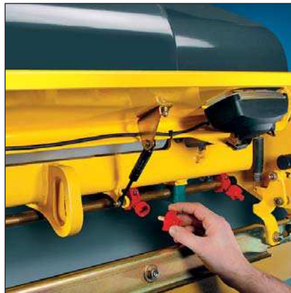
All weather performance: spray nozzles are wind-protected but are still easily accessible.

BOMAG provides local service and support no matter where your next contract is located.