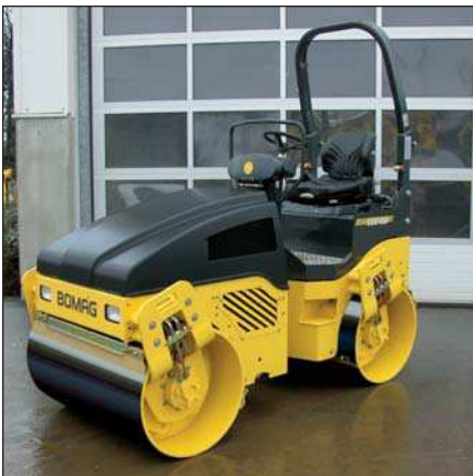
BW 125 AD-4: operating weight over 3 t.