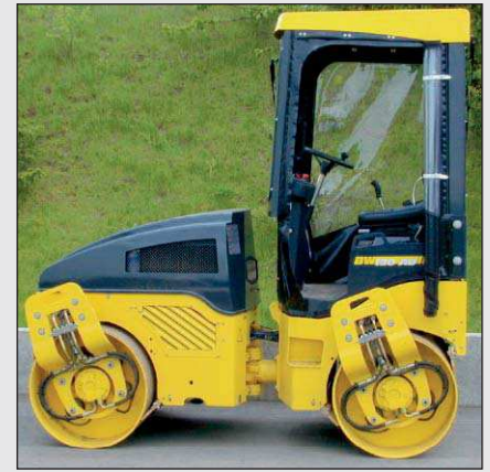
Option: all-weather protected cab

All models are standard equipped to a full specification but a range of options are available: a foldable ROPS provides an alternative to rigid roll over protection. Users appreciate the simple design on site. The edge compactor system from BOMAG includes a conical pressure roll designed for compaction close up to walls without the need for a second follow-up machine.