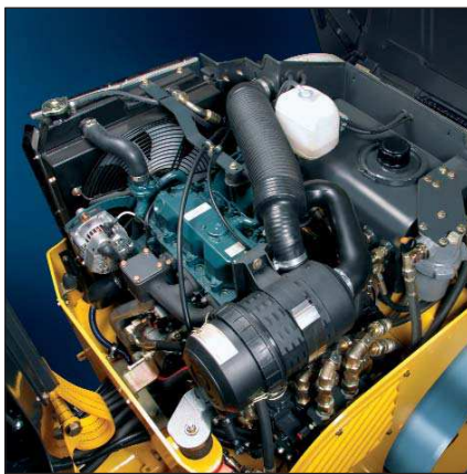
Easy and quick to service: everything has easy access.

In addition there are extended service intervals, e.g. 2,000 hours or 2 years for hydraulic oil and filter. BOMAG compaction technology looks after your money.