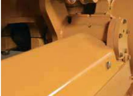
Smooth, tapered track covers provide easy undercarriage cleaning.

The undercarriage on the 1150K is built for precise, stable and low-cost operation. Heavy-duty pins, bushings and rollers provide long-term, hassle-free track life. Pinned equalizer beam suspension provides a smooth ride, stability and maximum traction for work on slopes, stump removal or pushing hard at low speeds – no matter what the conditions are.