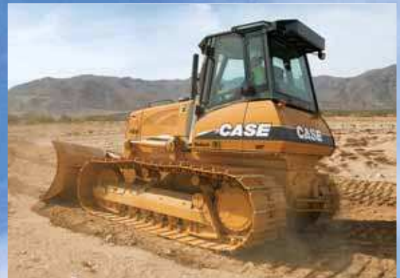
1150 K WT