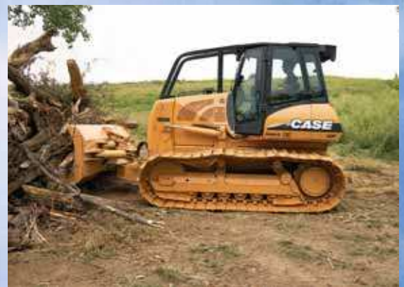
1150 K LGP