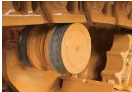
Two track frame-mounted carrier rollers maintain proper track tension.