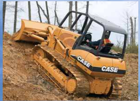
1150 K XLT