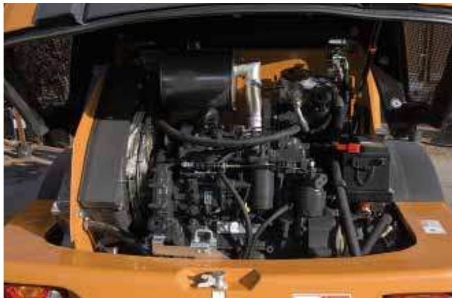
The flip-up hood makes access to the engine compartment simple.