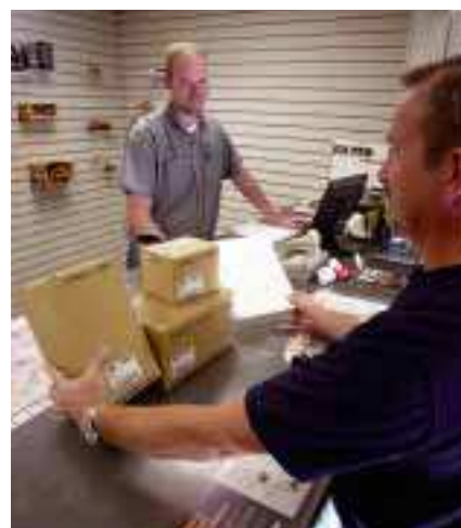
Your Case dealer is your professional partner with the know-how to keep your equipment up and running in peak condition.