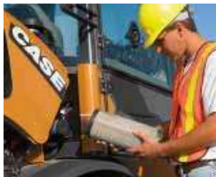
Daily service checks are completed from ground level, ensuring a quick start to a productive day.