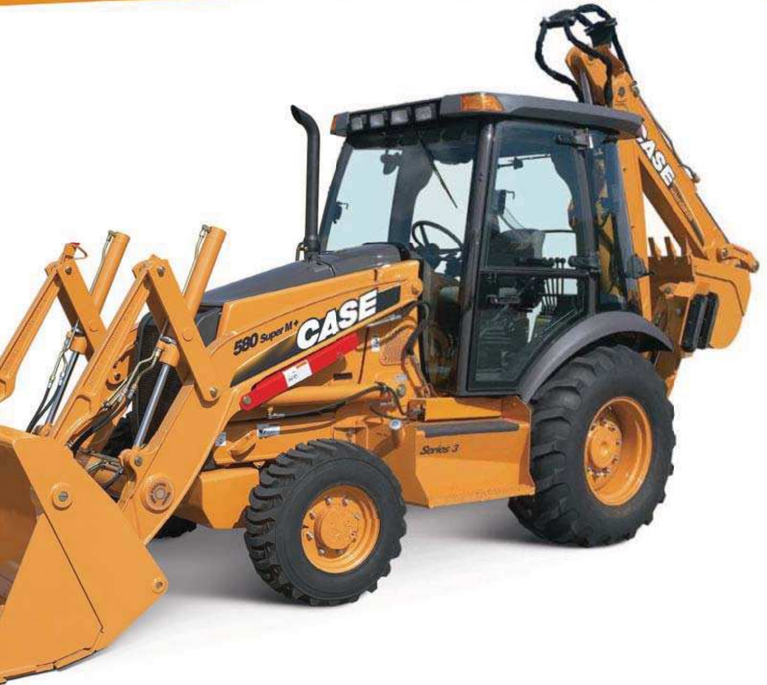
580 Super M