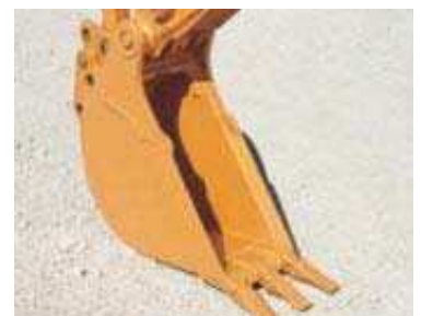
Choice of buckets