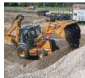
590 Super M+