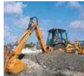
590 Super M