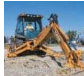
580 Super M