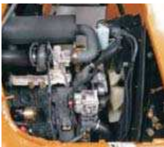
Poly vee fan belt with automatic tensioner and integrated water pump for maintenance-free cooling.