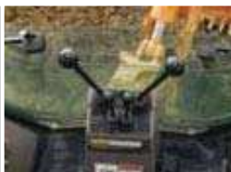
Manual 2-lever backhoe control.