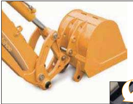
Hydraulic Quick Coupler

The integrated backhoe hydraulic quick coupler provides fast, efficient bucket and attachment changes, increasing versatility, saving time and maximizing productivity. The hydraulic coupler option is controlled by the operator from the cab.