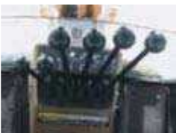
Case 3-lever with foot swing, for maximum backhoe feel.