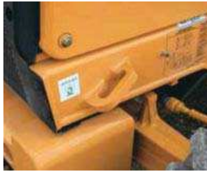
Features like remote lube points for axle pivots allow quicker daily servicing without crawling under the machine.