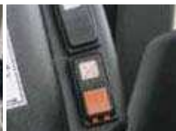
Pilot Control – in-cab locking pattern change switch from backhoe to excavator control.