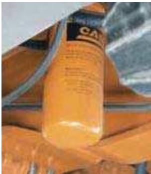
When it's time to change the oil, do it quickly and cleanly with genuine Case parts like the vertical spin-on oil filter.