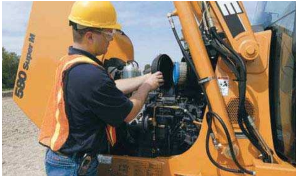
The M Series has a flip-up one-piece hood for easy access to the engine. Daily service points are conveniently grouped and can be reached from ground level. Designed for long life and superior service ease, Case M Series 2 Loader Backhoes deliver on your investment.

A componentized powertrain makes fast repairs of major components possible. The availability of remanufactured components for engines, torque converters, transmissions and axles keeps repair costs to a minimum.