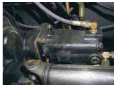
The hydraulic pump is directly mounted to the transmission with a zero-maintenance spline.