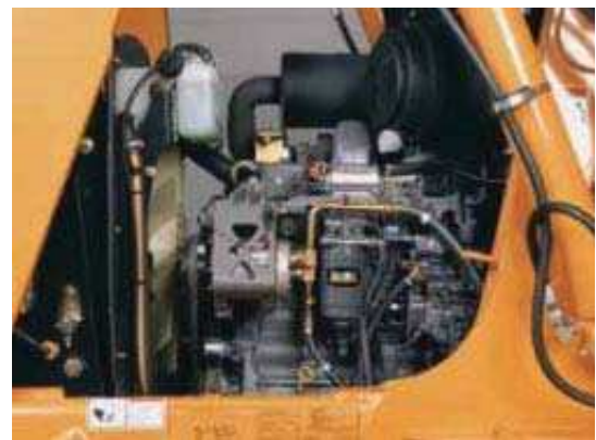
Both the hydraulic fluid and coolant fluid levels can be quickly checked by using the external sight gauge for the hydraulic fluid (top photo), and opening the hood to view the fluid level in the coolant reservoir (above).