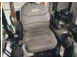
Low-effort Pilot Control – the ultimate in operator comfort.