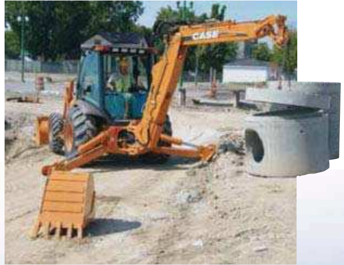
The M Series 2 Loader Backhoe provides exceptional craning power even when the Extendahoe® dipperstick is fully extended. The rugged external slide design reduces dirt ingestion and extends service life.

The proven Case over-center backhoe design offers a smoother ride when roading or traveling around the job site. It also helps the backhoe lift heavy loads and provides superior stability for climbing grades, even with a hammer mounted on the backhoe. Sturdy ductile iron stabilizers give the machine sure footing on a variety of surfaces. Pinned in position, combination, flip-over pads ensure protection on improved surfaces or provide the stability necessary for maximum crowd force in soil.