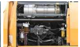
SCR Tier 4 Final