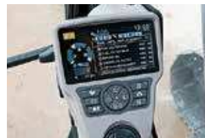
7" Color Monitor