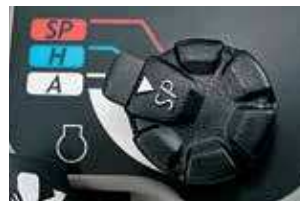
Three Power Modes

The CX210D employs an SCR Tier 4 Final solution that provides up to 5% greater fuel efficiency while providing exceptional power. SCR lets the engine run at peak performance throughout the work cycle and, because it works without a Diesel Particulate Filter, there's no DPF regeneration or costly filter to worry about replacing.