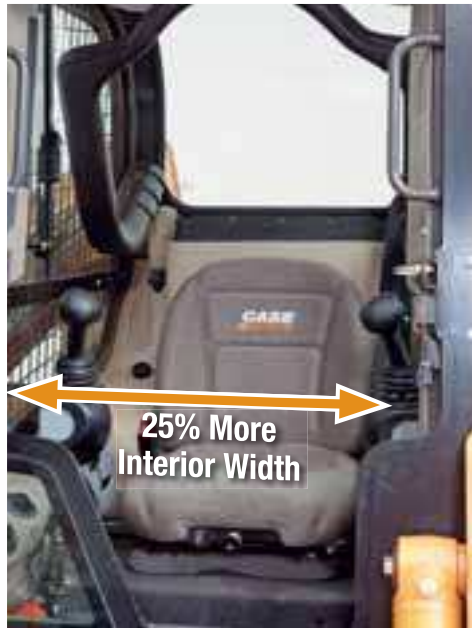
Your operators will be comfortable in the industry's widest cab.

Compare us to the competition. You'll feel the superior breakout force.