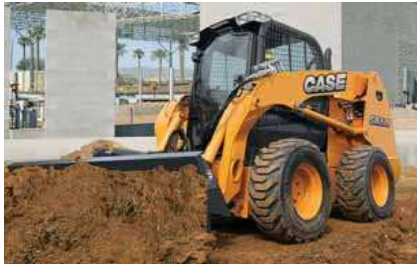
With a quick-coupler, you can switch attachments without leaving the cab.

Want more info? Visit www.Casece.com or www.CompareCase.com . Then, see your Case dealer for a demonstration, and put a new Case skid steer to work.