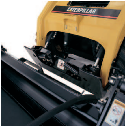
Optional Hydraulic Quick Coupler

Choose from a wide variety of tools that are performance matched to the Cat Skid Steer Loader.