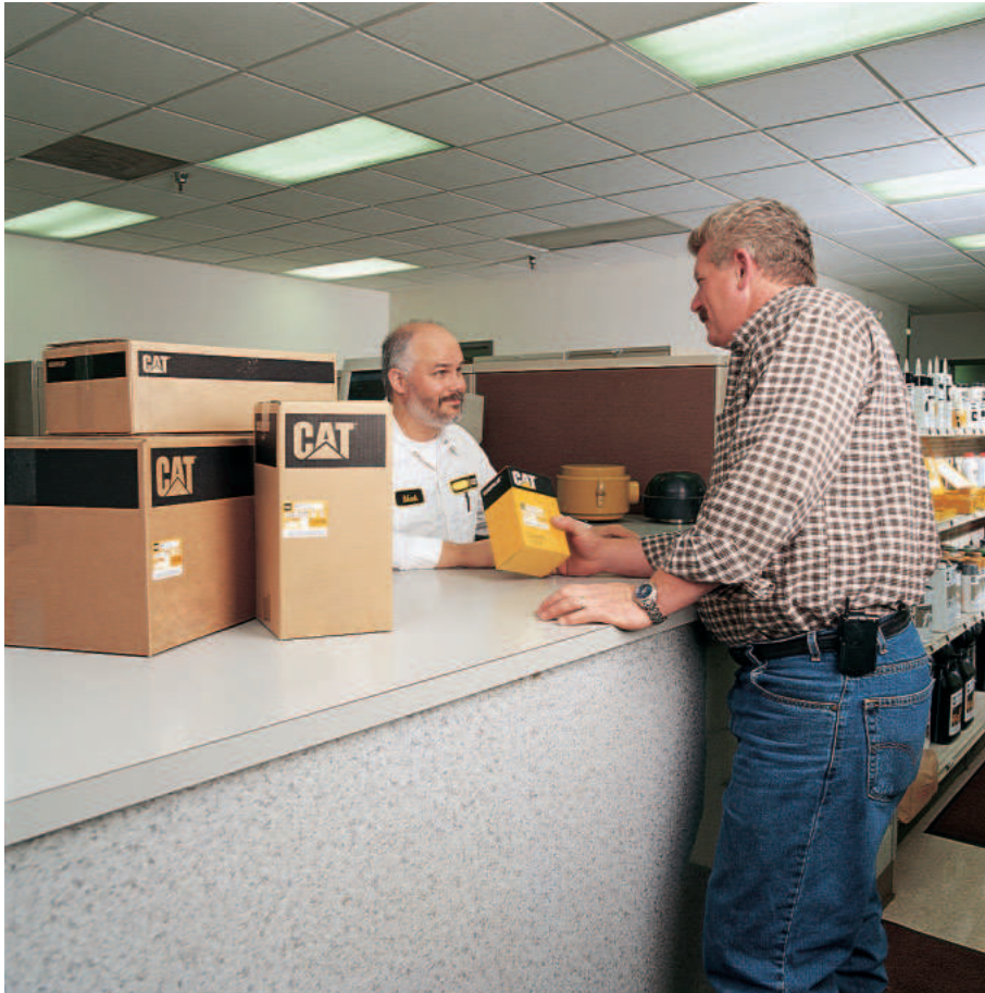
Worldwide Parts Availability

Cat dealer services help you operate longer with lower costs.