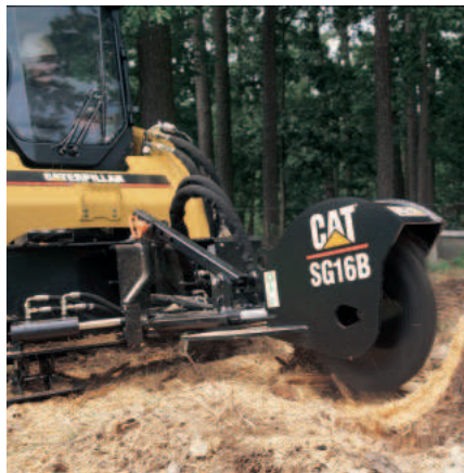
Cat SG16B Stump Grinder

An optional hydraulic quick coupler is also available and allows engagement and disengagement of work tools without the operator needing to exit the machine. Control of the coupler by use of a rocker switch inside the cab makes work tool changes quicker and easier.