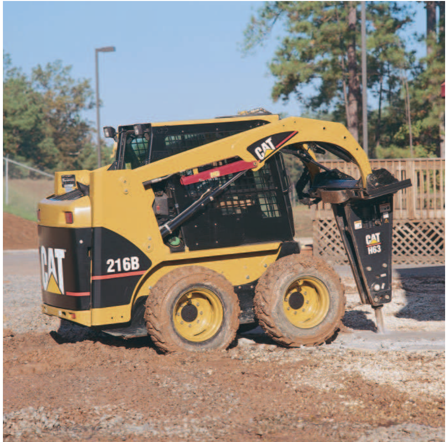
Powerful and Reliable

Auxiliary Hydraulics. Standard auxiliary hydraulics to power work tools are available through quick connect hydraulic couplings that are rigidly mounted to the loader arm. The Caterpillar line of high pressure XT™ ES hoses and O-ring face seals help assure a leak free system.