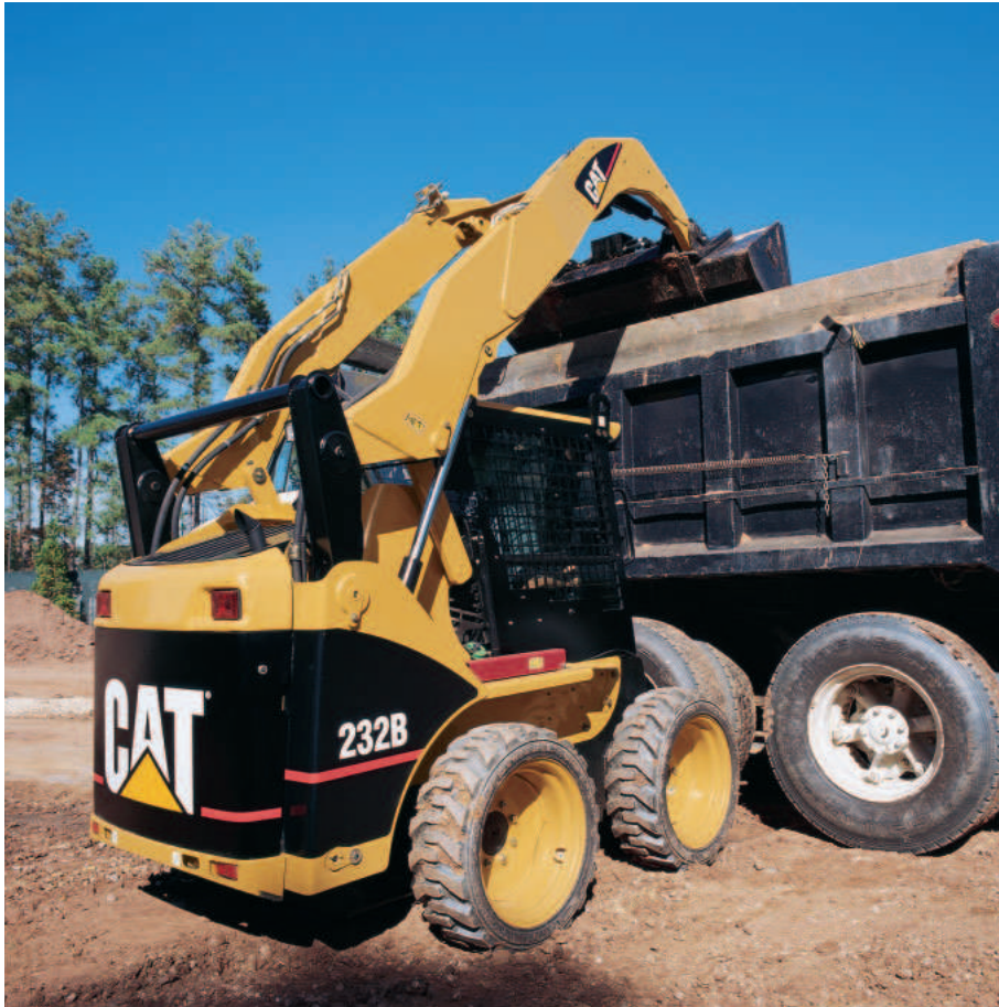
Powerful and Reliable

The Caterpillar hystat power train delivers aggressive performance and easy operation.