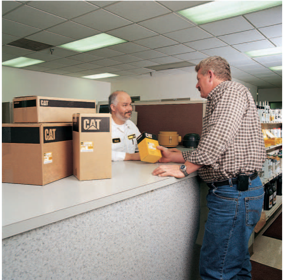
Worldwide Parts Availability

Machine Support. Machine support is one of your Cat dealer's primary goals. Nearly all parts are available at your Cat dealer. If not, your dealer can use the Caterpillar worldwide computer network to find the closest in-stock parts to minimize machine downtime. Your Cat dealer can also save you money by suggesting Cat Remanufactured parts that carry the same warranty as new but with savings of 40 to 70 percent.