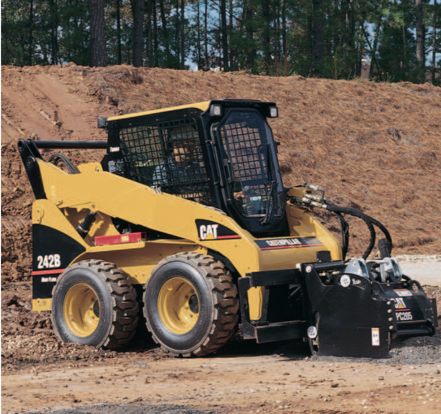
Powerful and Reliable

The hydraulic system has built-in reliability and provides exceptional lift, breakout and auxiliary power to work tools.