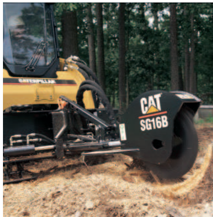
Cat SG16B Stump Grinder

An optional hydraulic quick coupler is also available and allows engagement and disengagement of work tools without the operator needing to exit the machine. Control of the coupler by use of a rocker switch inside the cab makes work tool changes quicker and easier.