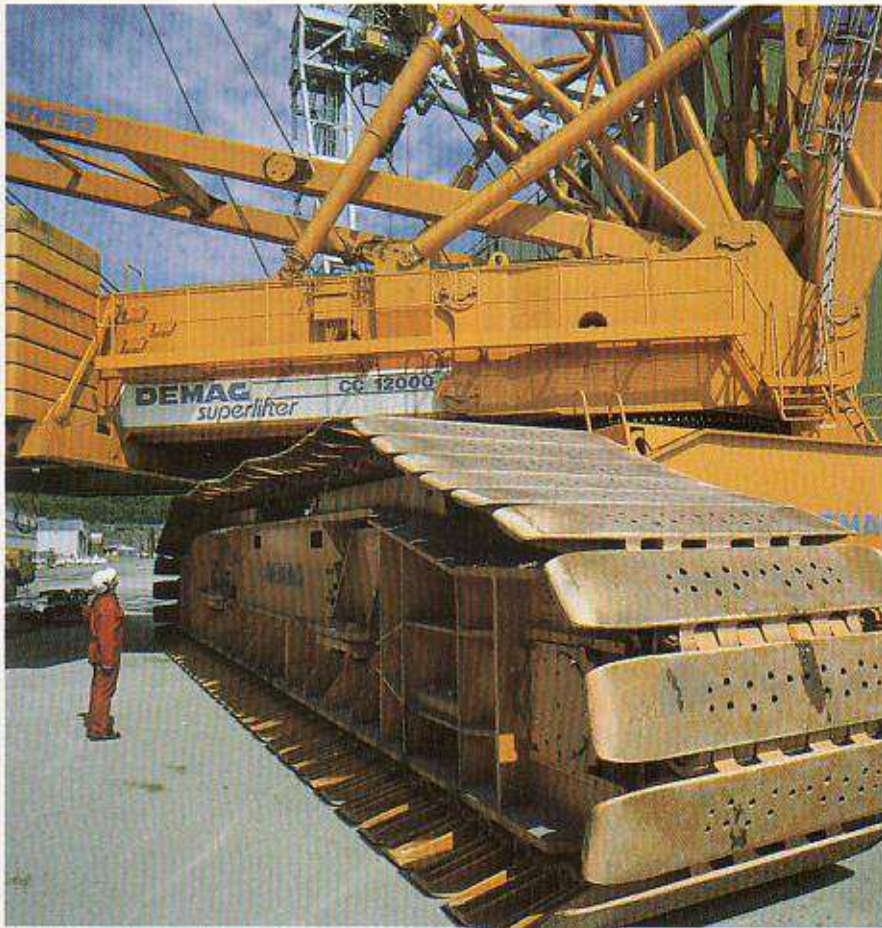
The biggest, but mobile