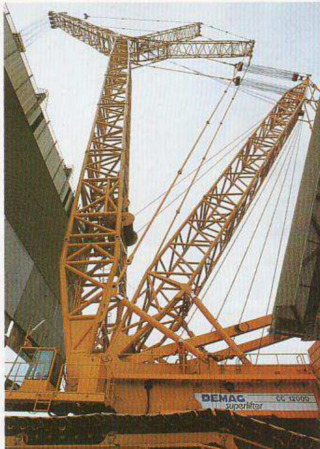
High and strong