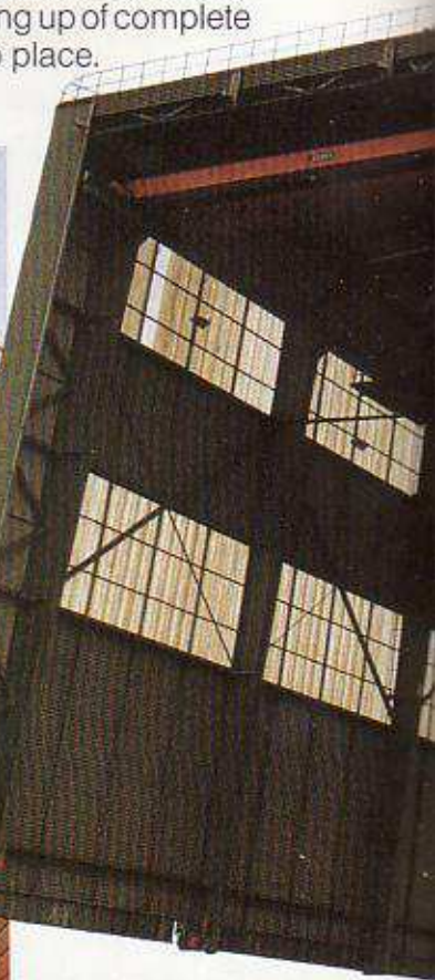
The practice ▶