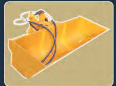
Ditch bucket w/tilt