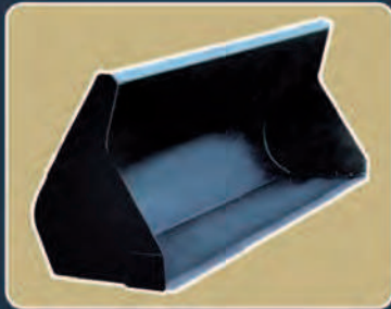
GP buckets w/teeth or cutting edge and forks