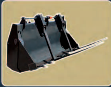
Multi-purpose buckets w/teeth or cutting edge and forks