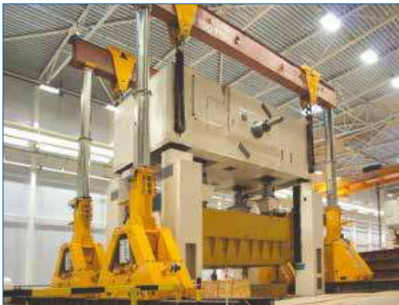
◀ SBL-1100 Series, Hydraulic Gantry.