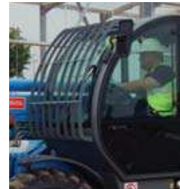
WINDSHIELD PROTECTION GRID