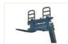
FORKS WITH HYDRAULIC SIDE SHIFT