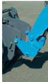
QUICK COUPLING OF TOOLS FROM CAB