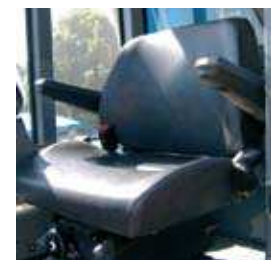
ADJUSTABLE SUSPENDED SEAT WITH ARMRESTS