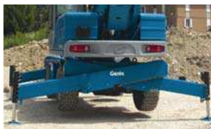
STABILIZERS ON ROTATING AND ELITE ROTATING MODELS