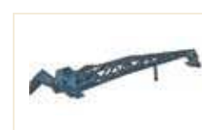
JIB WITH HYDRAULIC WINCH