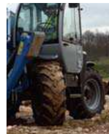
FOUR-WHEEL DRIVE FOUR-WHEEL STEER