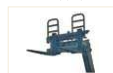
FORKS WITH HYDRAULIC SIDE SHIFT