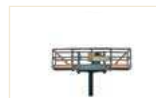
EXTENDABLE ROTATING MAN-PLATFORM