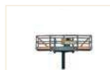
EXTENDABLE ROTATING MAN-PLATFORM