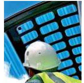
ROOF PROTECTION GRID