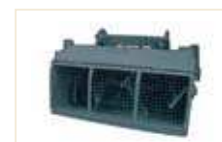
MIXING BUCKET (500 L)