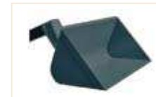
LOADING SHOVEL (800 L)