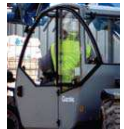
DOOR IN TWO SECTIONS: STEEL LOWER, GLASS UPPER. EACH SECTION CAN OPEN INDEPENDENTLY.