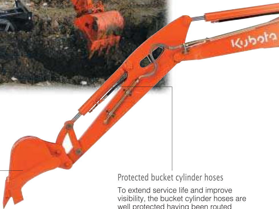
Digging arm and bucket

With the ability to deliver the most digging power, plus the efficiency of a long arm, the KX71-3 produces the largest digging depth of all long-arm mini-excavators*. Even with its long arm specification, the KX71-3 amazingly generates the biggest force for both arm and bucket digging*. Moreover, it has the ability to perform a wide range of tasks. (* In its class.)