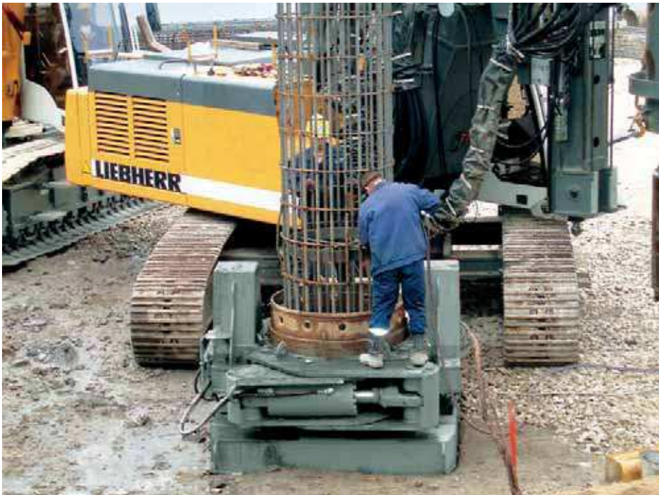
VRM KL in operation

The short hydraulic casing oscillators have been designed in accordance with the latest technical know-how. The Hydraulic Casing Oscillators KL are perfectly suited for mounting Liebherr Piling and Drilling Rigs, series LRB as well as LB. Extremely sturdy construction guarantees cost-efficient use on site. By means of exact statical calculations in conjunction with higher quality material, an optimum conformity of loads, weight and material strength is achieved. The internal welding stresses – difficult to determine for static calculations, which would affect the construction considerably – are eliminated by means of stress relieving prior to machining. A prominent feature of the equipment is the clamping collar consisting of five links operating on the boring implement. The individual links surround the casing like a chain so that a consistent surface pressure is exerted on the casing circumference. In addition, the large height of the collar (340-500 mm resp.) prevent any damage to the casing. By means of easily exchangeable reducer pieces the oscillator can be converted, within a few minutes, to a smaller casing diameter. The collar opens uniformly