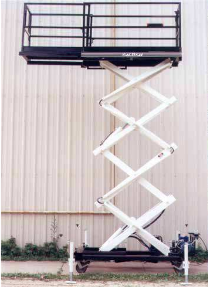
MP STANDARD (shown with optional Extenda-deck)