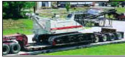
Load #1 - under 90,000 lbs (40 823 kg)

The LS-138H II easily transports in three loads, each less than 12' (3.66 m) in overall width. With its lightweight modular components, no other crane is faster, easier or more efficient to transport.