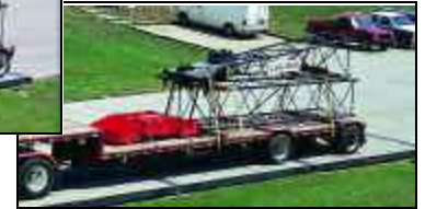
Load #3 - under 33,000 lbs (14 968 kg)