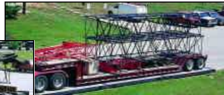
Load #2 - under 36,000 lbs (16 329 kg)