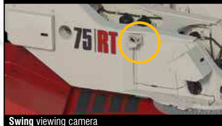
Swing viewing camera