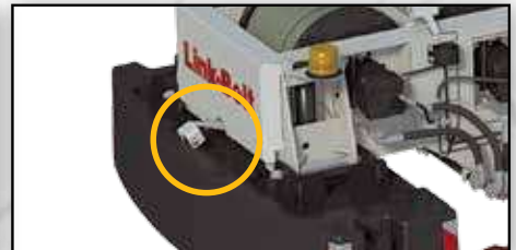
Rear viewing camera