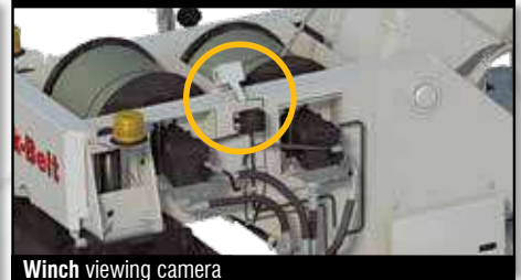
Winch viewing camera