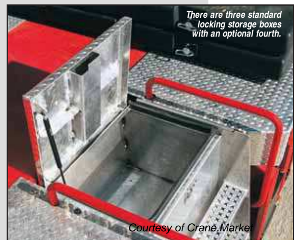
There are three standard locking storage boxes with an optional fourth.