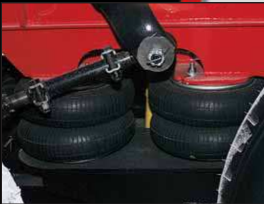
Raydan™ air-ride suspension front and rear provides a smooth ride and precise handling. Optional air-ride lift system holds the rear axles level while the crane is on outriggers.