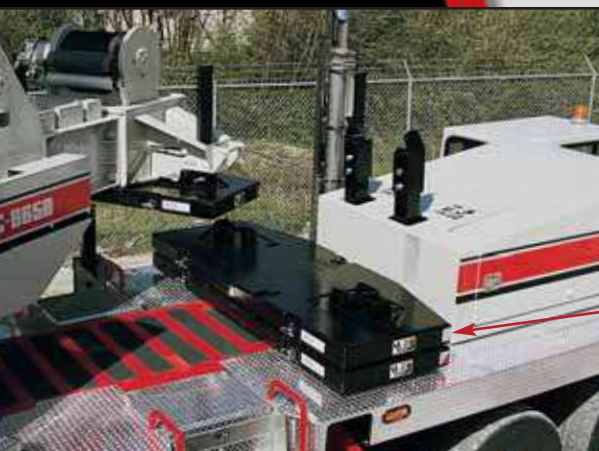
Modular counterweights offer up to four lifting combinations