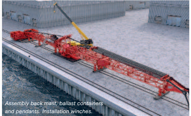
Assembly back mast, ballast containers and pendants. Installation winches.

market developments, anticipate new customer demands and develop innovative concepts and solutions. The members of the Think Tank saw an increase in demand for engineered heavy lifting and transport in remote areas and locations with limited infrastructure, leading to a growing need for equipment that combines easy mobilization, low ground bearing pressure and high capacity.