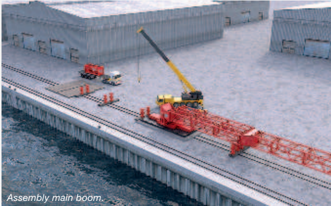
Assembly main boom.