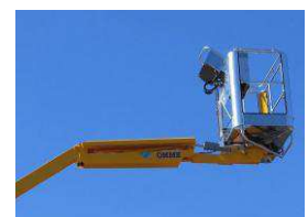
Fly jib (option)