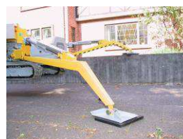
Easy set up