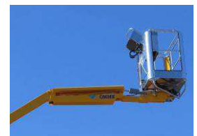
Fly jib (option)