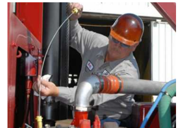
Easily Accessible Daily Checks