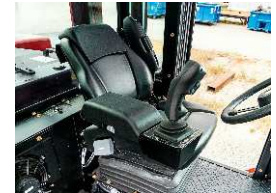
Fully Adjustable Mechanical Seat (Standard)