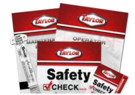
Vehicle Information Package (Standard)