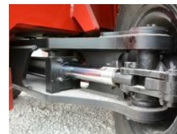
Industry's Toughest Steer Axle (Standard)