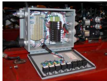
Heavy Duty Circuit Breakers/Reset Switches (Standard)