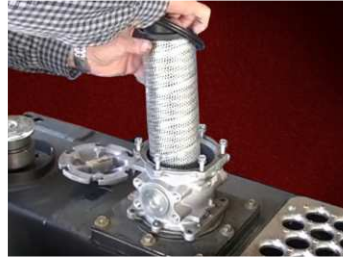
Spin-on Breather, Wire Mesh Strainer & Replaceable Internal Element (Standard)