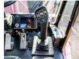
11 Button Command Joystick (Standard)