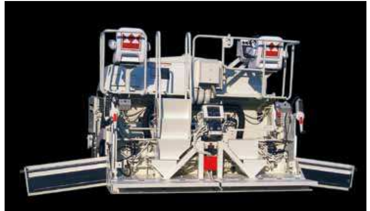
▪ Fastach Fixed-width Screed

The Fastach 10 screed is built to handle any paving application, offering widths for the CR400 Series pavers from 10 to 28 ft (3.0 to 8.5 m) with quick mounting extensions. Available hydraulically extendable strike-offs and screeding blades extend base screed width by 4 ft (1.2 m) on either side, giving you up to an 18 ft (5.5 m) base paving width.