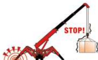
UNIC stability protection system