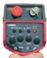
Radio remote control