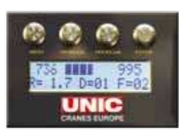
Full safe load indicator