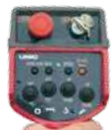
Radio remote control