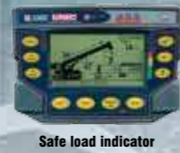
Safe load indicator