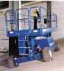
The Speed Level allows fast platform levelling on slopes and uneven ground.