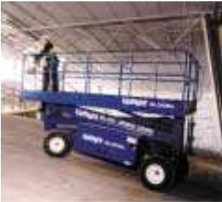
All models have oscillating axles to keep drive wheels in contact with uneven ground and have high levels of gradeability for tough sites and loading ramps.