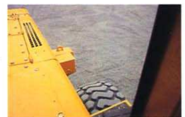
Excellent rear visibility enables the operator to see both the counterweight and the rear wheels.