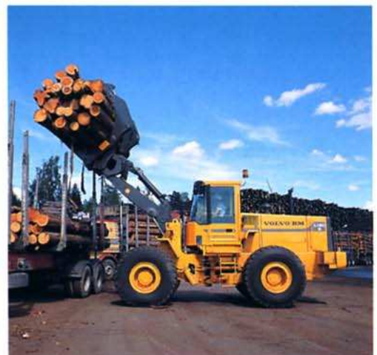
Generous breakout torque, reach and lift height make it easy to handle heavy loads even in the top position.

The new, load-sensing steering system allows precise steering regardless of load, engine speed and driving surface. The system saves energy and makes the machine easy to manoeuvre even in difficult terrain.