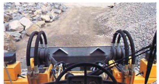
The new, curved windshield provides panoramic visibility over the work site.

As you can see, the Care Cab does justice to its name.