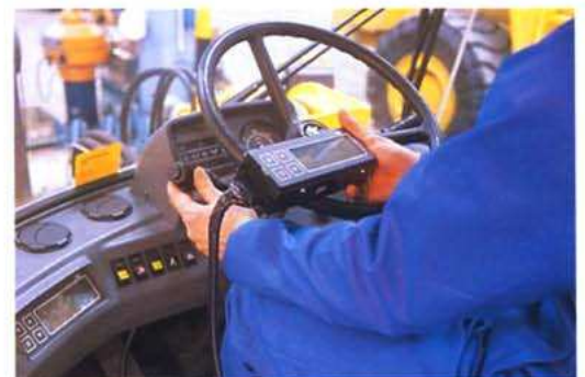
The Contronic system allows for quick service diagnosis. The system collects data from a number of analog sensors. Quicker troubleshooting gives shorter down time.

Contronic simplifies maintenance and thereby can help to reduce maintenance and repair costs.