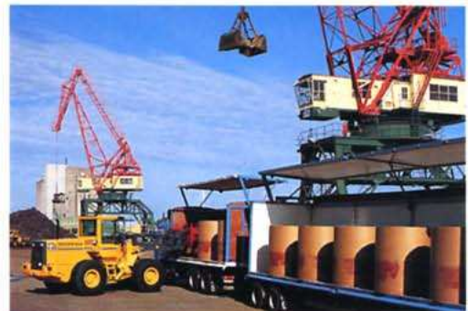
The L90B is an easy-to-manoeuvre materials handler for high-capacity work and heavy loads in harbours and in industrial applications.

With the optional Boom Suspension System, the rocking tendencies at high speeds are eliminated regardless of load. This further boosts work capacity, operating safety and comfort.