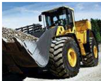
Volvo Construction Equipment