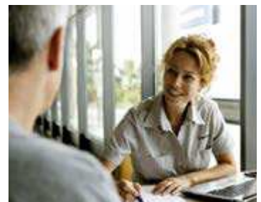
Volvo Financial Services