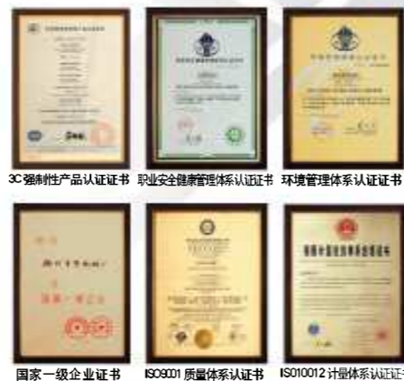
3C强制性产品认证证书 职业安全健康管理体系认证证书 环境管理体系认证证书 国家一级企业证书 ISO9001 质量体系认证证书 ISO10012 计量体系认证证书

地址: 中国江苏徐州市铜山路165号 Add.No.165 Tongshan Road Xuzhou Jiangsu China 电话(Tel): 0516-83462242 83462350 传真(Fax): 0516-83461669 邮编(Post Code): 221004 网址(URL): http://www.xzxc.com.cn E-mail: xzxcyx@pub.xz.jsinfo.net 服务电话(Service Tel): 0516-83461183 服务传真(Service Fax): 0516-83461180 质量监督电话(Quality Inquiry Tel): 0516-87888268 备件电话(Spare Parts Tel): 0516-83461542 大修厂(Overhaul Factory): 0516-83461904