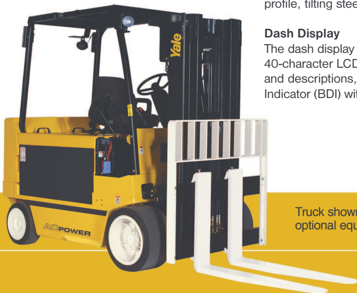
Truck shown with optional equipment

On-demand power steering is standard and the all-hydraulic design gives precise, reliable control while eliminating mechanical linkages and road shocks at the steering wheel. A five-position tilt steering column provides excellent operator comfort and visibility. A brushless motor operates at a very low speed when not in use, conserving energy and reducing noise levels.