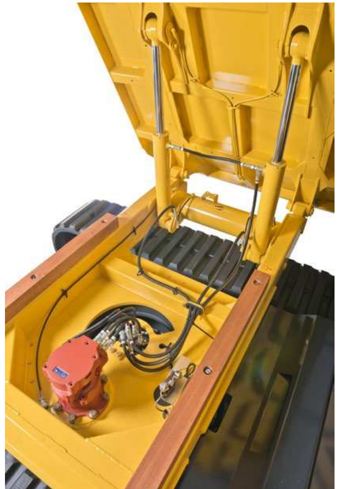
C50R-5 with turning wagon