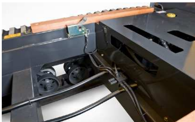
C50R-5 with standard wagon